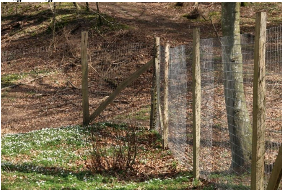
Figur 1 – Højde og udformning af hegnet.