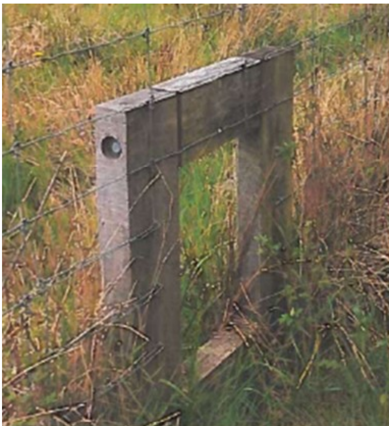
Figur 2 – Faunapassage.